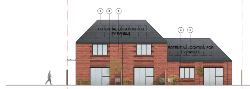
East Block rear elevations