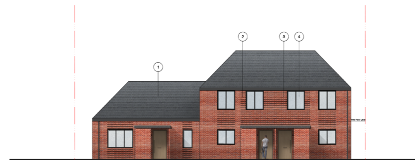
East Block Front elevations