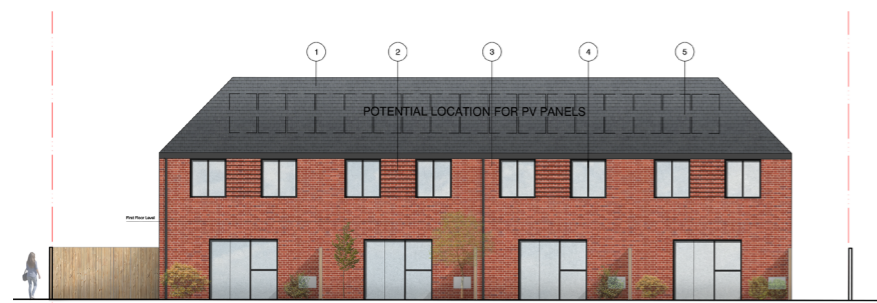
West Block rear elevations