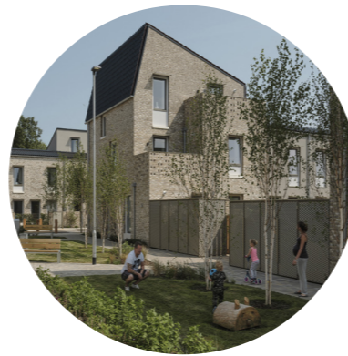
Examples of landscapes