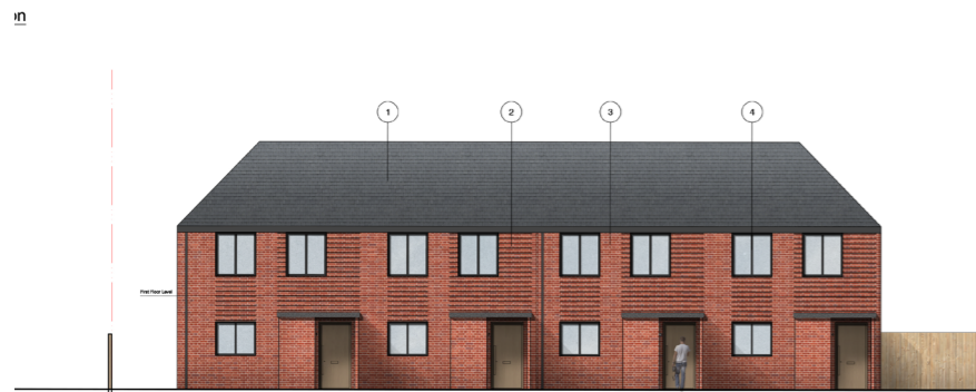
West Block Front elevations