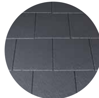
Grey roof tiles