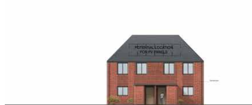
West elevation (Front)