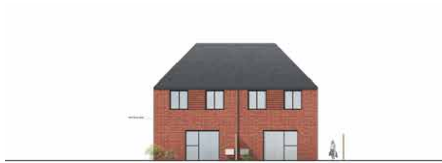
East elevation (Rear)