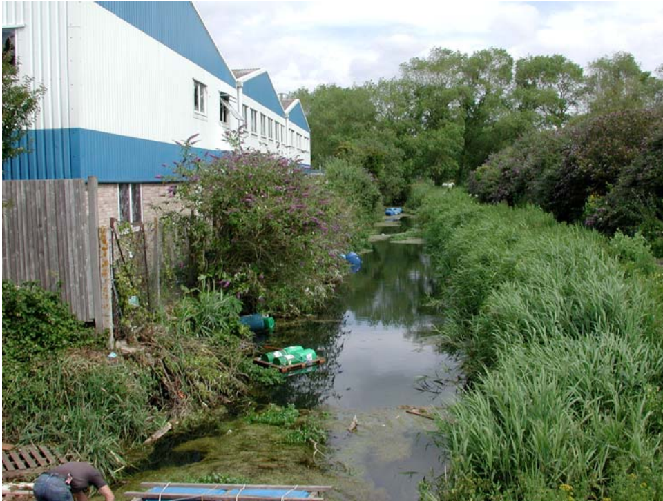
A section of the River Ditch Critical Ordinary Watercourse prior to clearance.