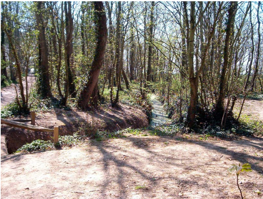
View of an Ordinary Watercourse carrying land drainage from the outfall in the left foreground along the ditch to a sea outfall

In addition to the above a small number of landowners have significant riparian responsibility for ordinary watercourses situated on their land. Railtrack, Glaxo SmithKline and Sompting Estates between themselves are responsible for approximately 3.5 km of watercourses within Worthing.