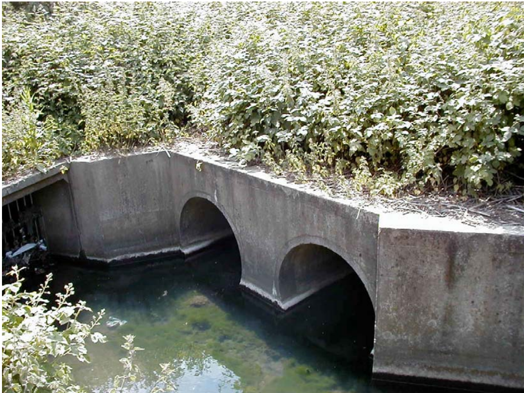
View of the River Ditch / Teville Stream confluence.

See the two drawings appended to this report for detailed locations of these Critical Ordinary Watercourses.