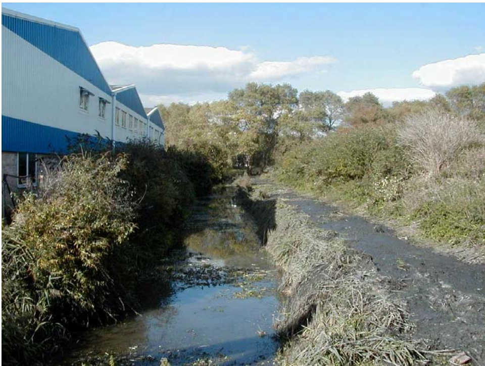
The same section after mechanical clearance of silt and debris using an 18 tonne 360 Excavator. Note that silt has been deposited on the bank while man-made debris is taken off site for disposal.