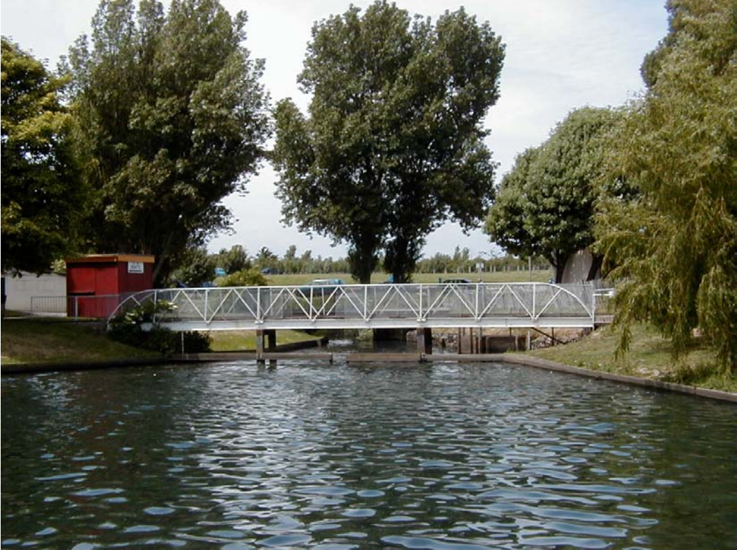
View of the north end of Brooklands where the Teville Stream flows into the lake

An adjustable weir and three non-return valves at the southern end are used to control the level of the lake.